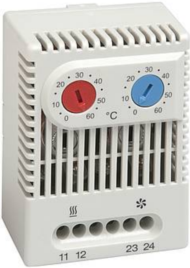
DUAL THERMOSTAT ZR 011

www.stego.de > Products > Regulating > Regulators > Combination: NC/NO Print