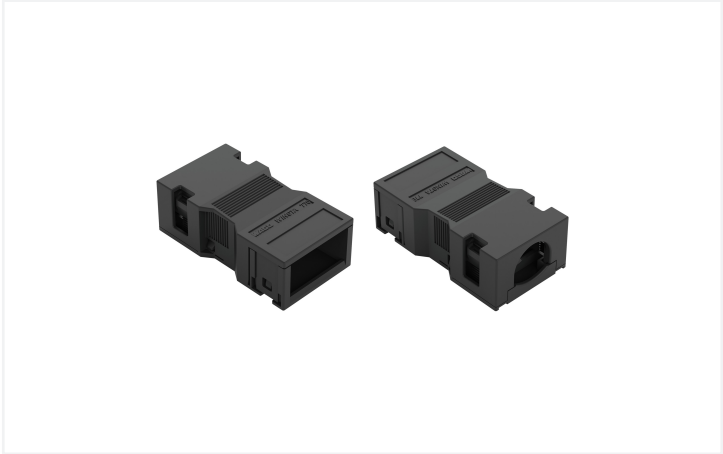
Color: ■ black