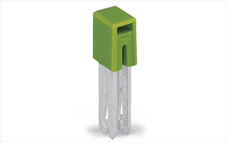
Color: ■ yellow-green