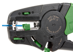
Partially stripping a conductor.