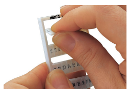
Separating a strip from the WMB or WMB marker card.