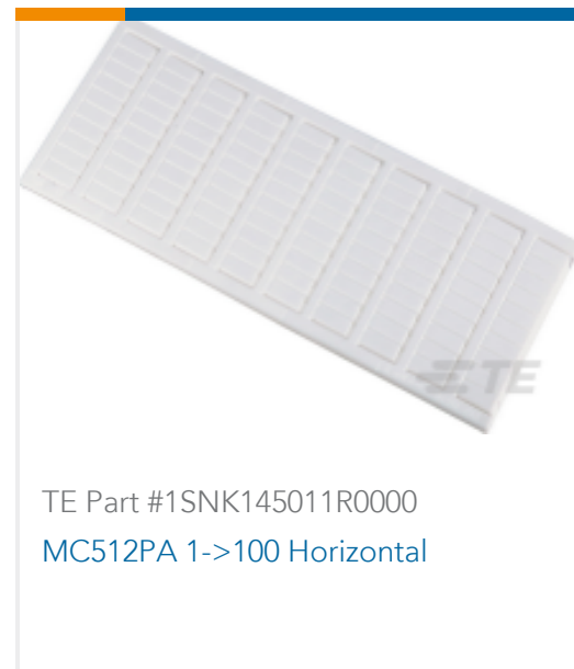
TE Part #1SNK145011R0000 MC512PA 1->100 Horizontal