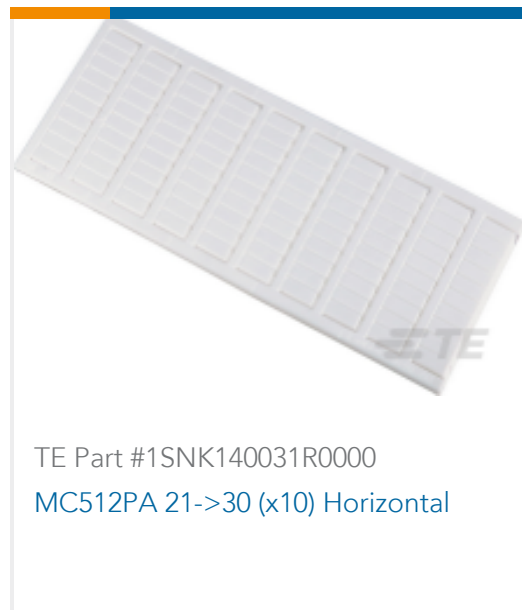
TE Part #1SNK140031R0000 MC512PA 21->30 (x10) Horizontal