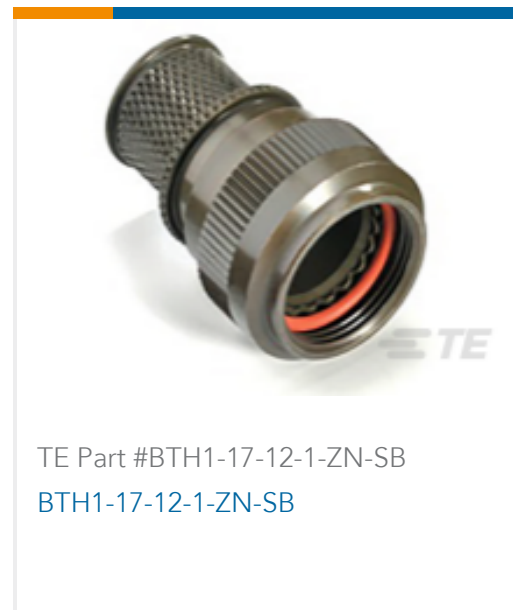
TE Part #BTH1-17-12-1-ZN-SB BTH1-17-12-1-ZN-SB