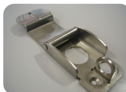
ST Padlock Device

* Internal door available fitted on request