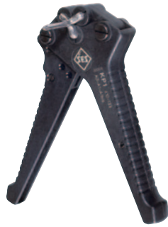
sleeve expanders serie KP D1/1-01

If you need more details, please see " TOOLS " chapter of this catalogue, Group D1.