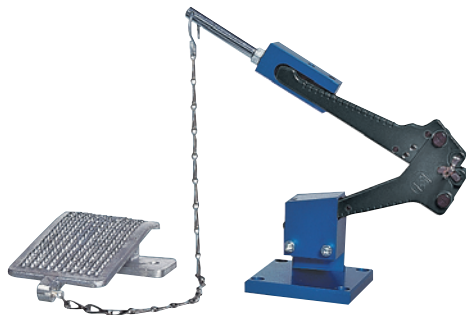
bench mounted sleeving tool with foot pedal D1/3-01