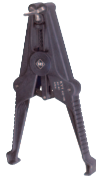
sleeve expanders series KY D1/1-03