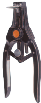
sleeve expanders series KN and KNS D1/2-01